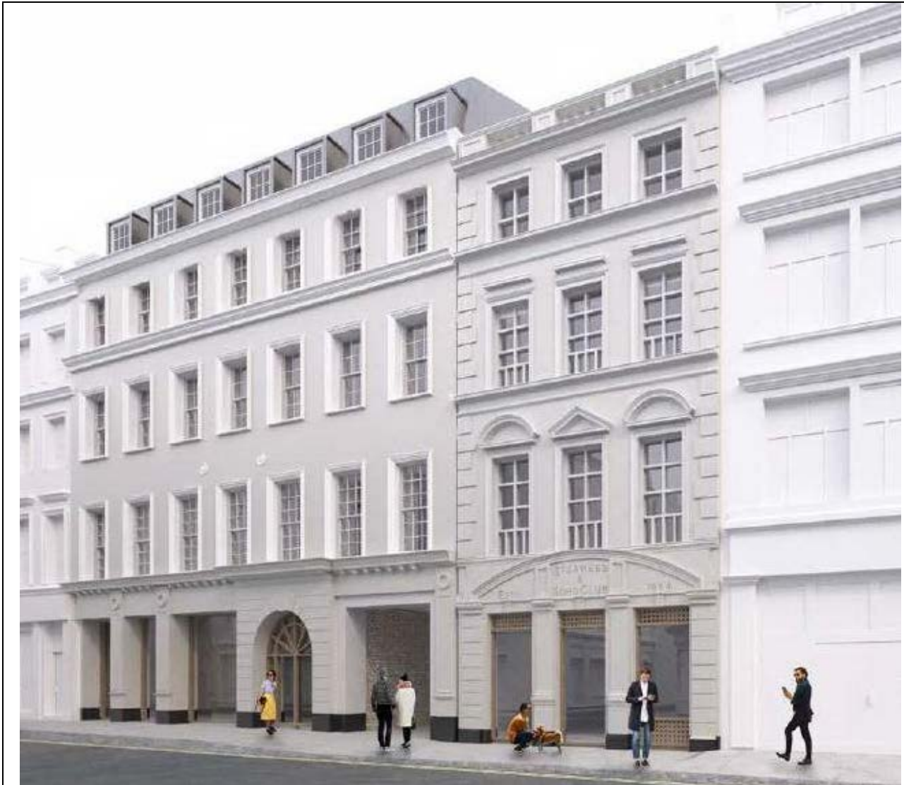
Greek Street elevation