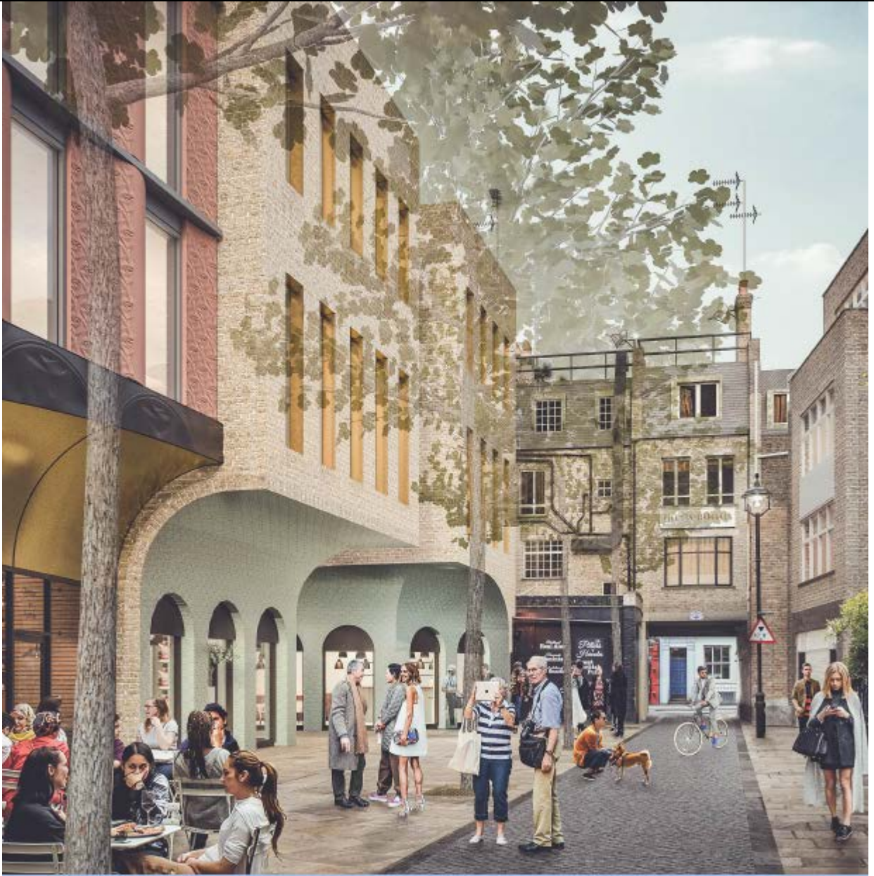
Manette Street looking towards Greek Street