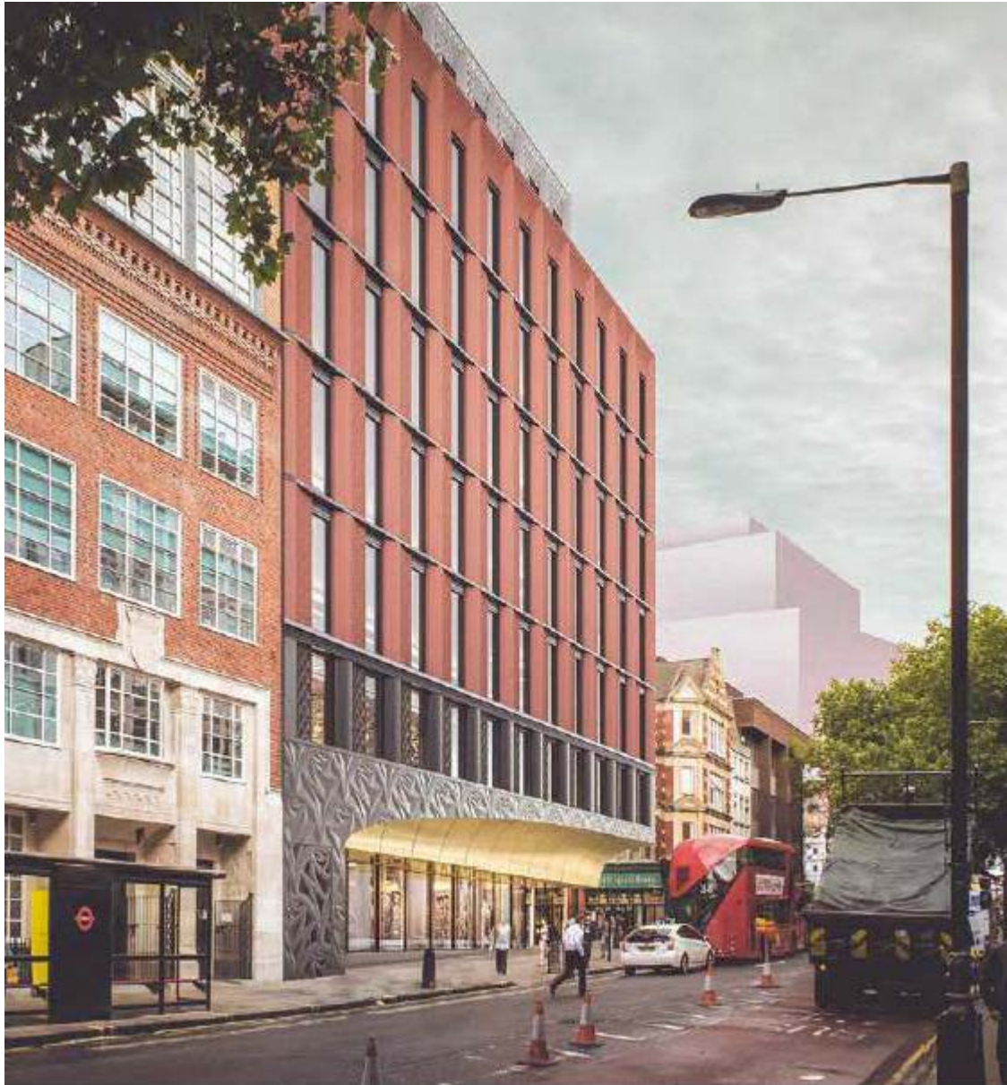
Charing Cross Road elevation