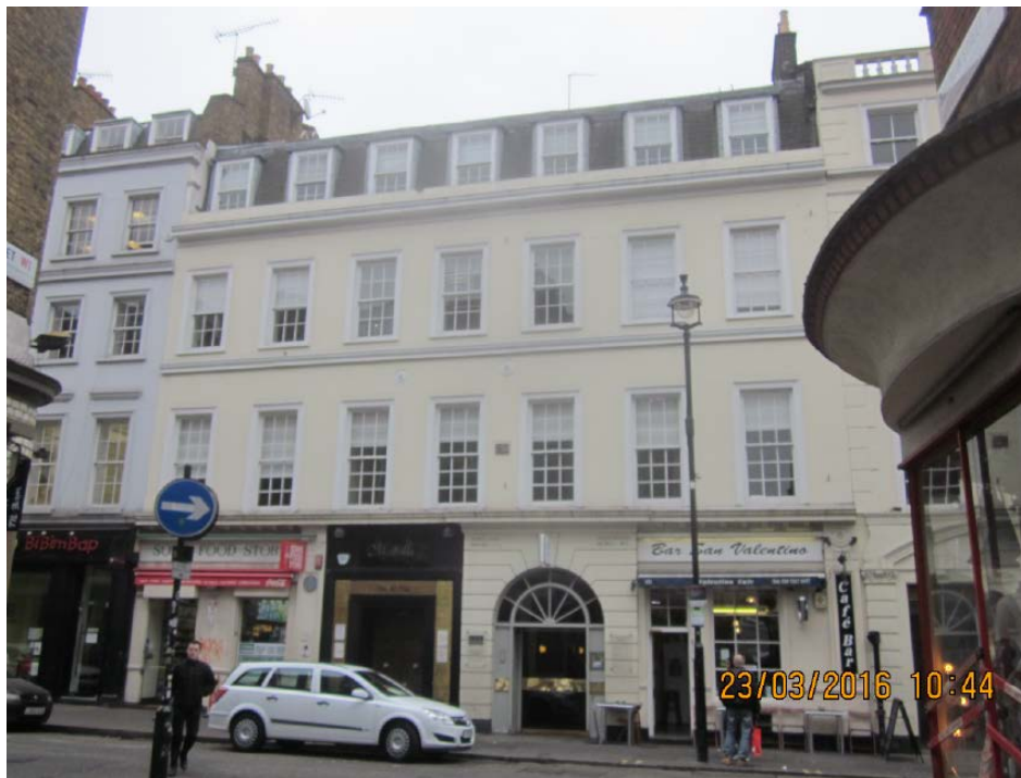
12-13 Greek Street