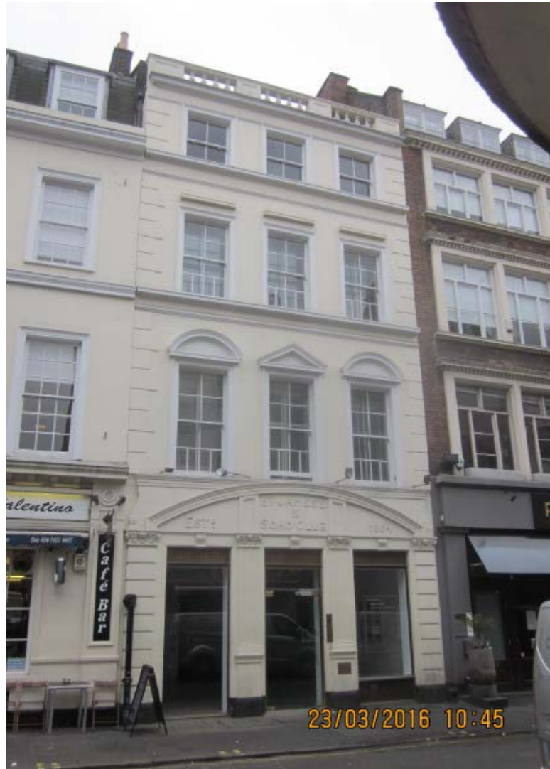
14 Greek Street