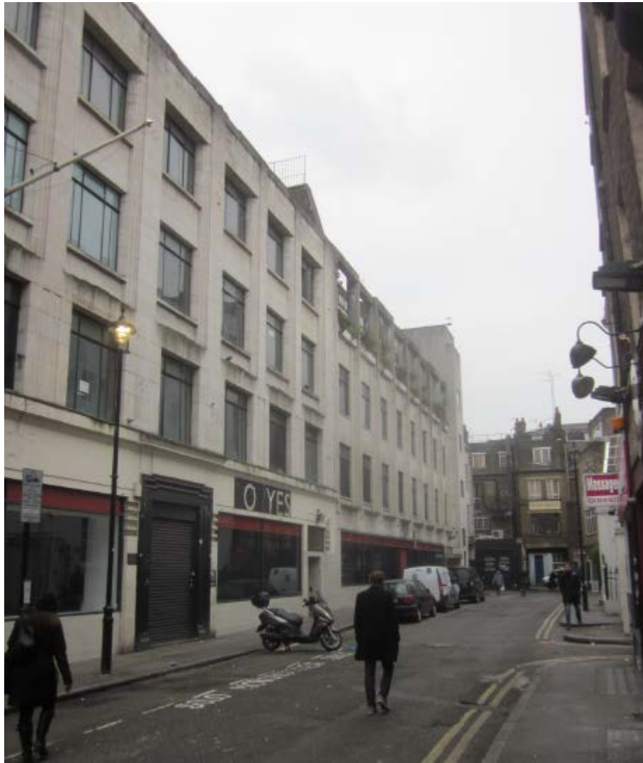
Manette Street elevation