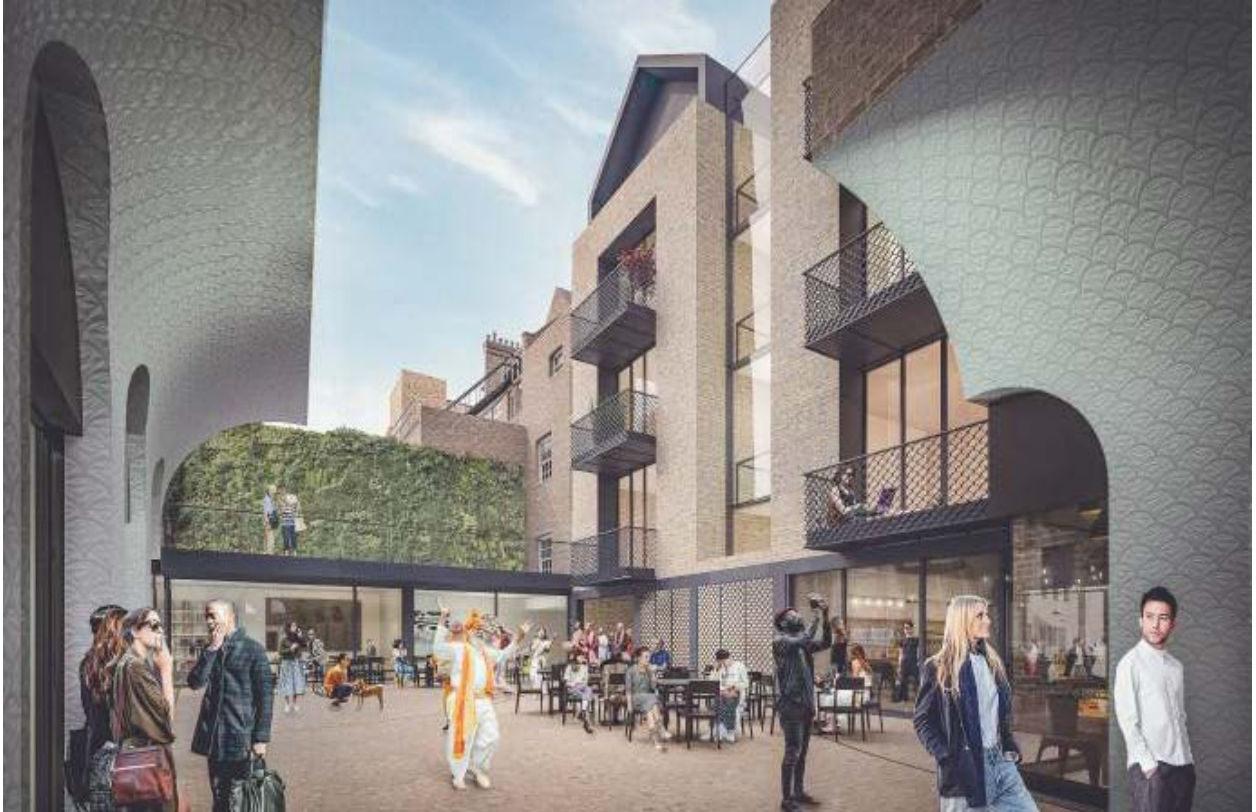
Courtyard looking towards the rear of 12-13 and 14 Greek Street