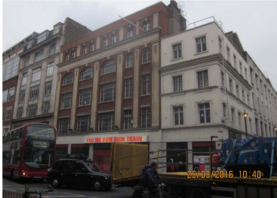
Charing Cross Road elevation